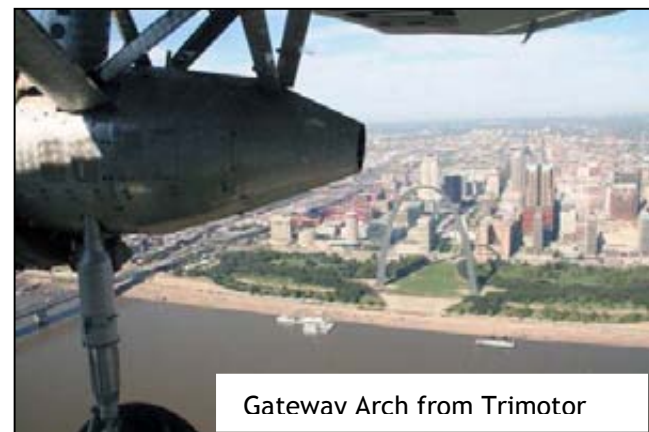
Gateway Arch from Trimotor

In total, we flew approximately twenty-five flights of the Tri-Motor and seldom had an empty seat. As far as I am aware, every volunteer, who worked multiple days at the event, was provided, either by EAA or an individual sponsor, a free ride. I'll go out on a limb and state the biggest smile of the event was on the face of the Civil Air Patrol cadet who was sponsored on the last flight of the day Saturday.